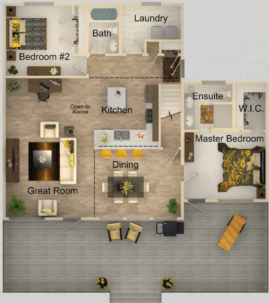
Main Floor 1360 Sq.Ft.