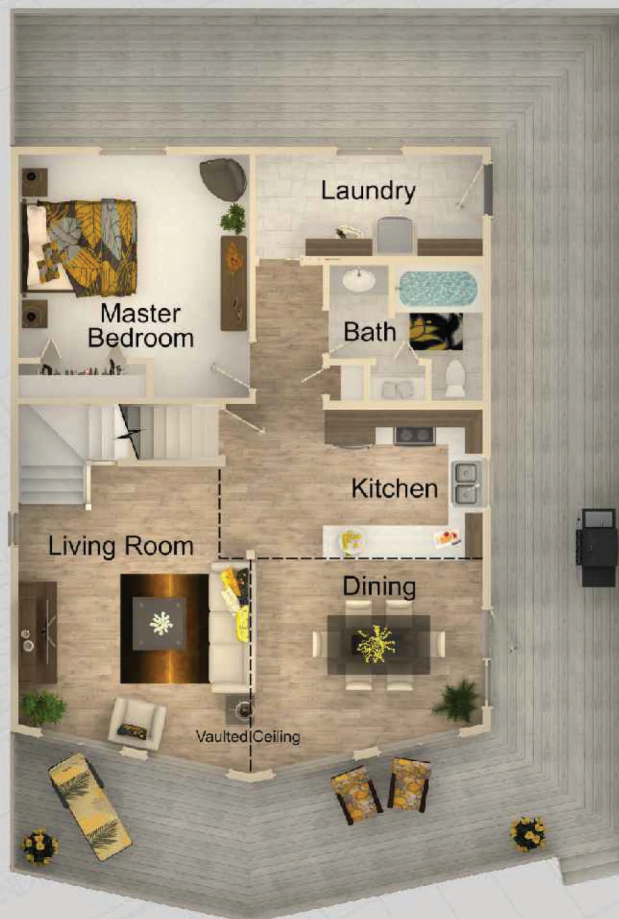
Main Floor 994 Sq.Ft.