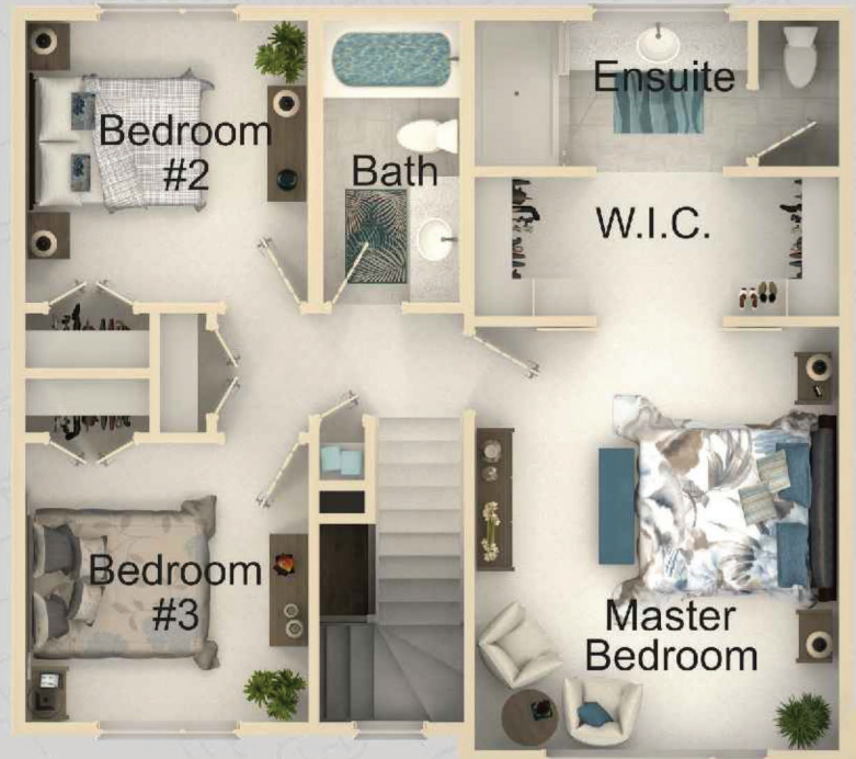
Second Floor 745 Sq.Ft.

NOTE: Artist's renderings do not reflect actual home specifications.